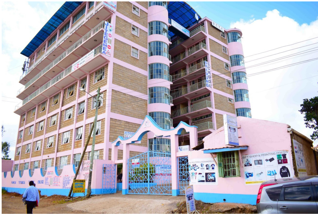
Pamoja Technical Training Institute's state of art building at Nkubu Town in Meru County

The inimitable college has rolled out programmes with a focus on engineering, business, IT, Catering, building technology, management,