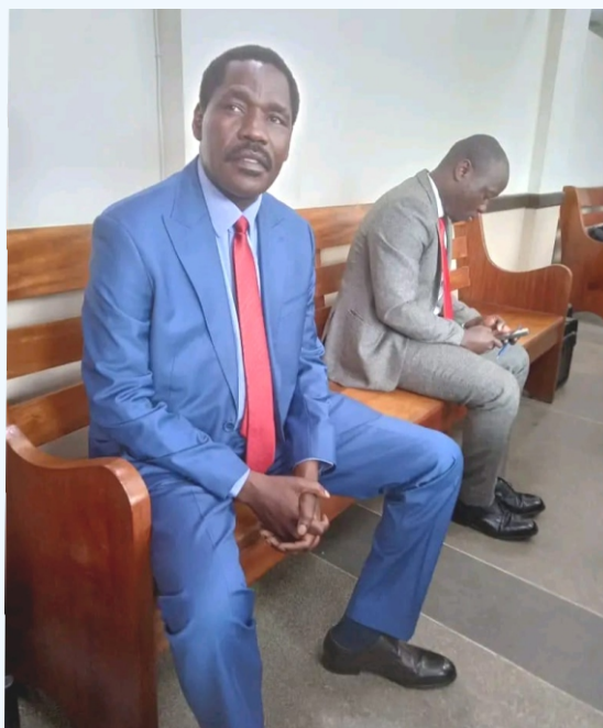
Former Agriculture CS Peter Munya