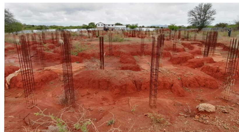
The stalled multi-million Tharaka Nithi County Assembly project at Kathwana

The speaker accused the governor of diverting money allocated for the building every year despite allocating it to the budget.