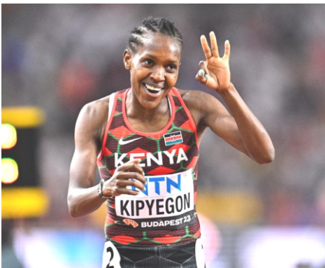
World 1,500M and 5,000M champion Faith Kipyegon

Double Olympic champion Faith Kipyegon won Kenya's first gold