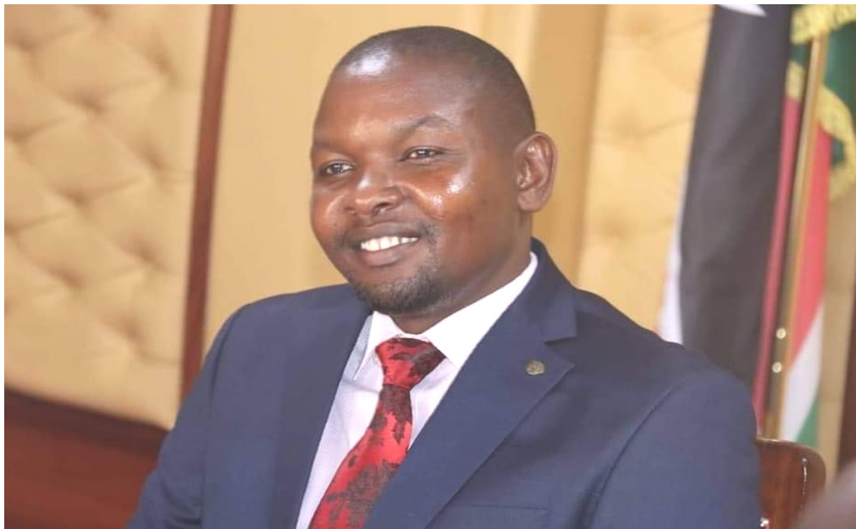
Meru County Deputy Governor Mutuma M'Ethingia