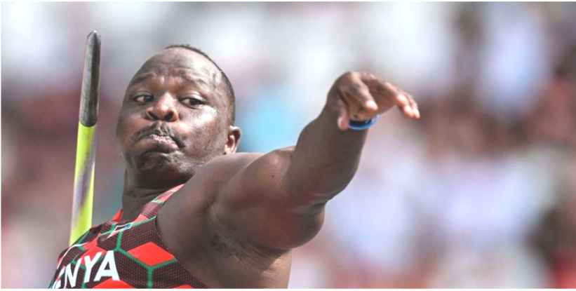
2015 world javelin champion Julius Yego

Many sports fanatics have a feeling that Yego's time at international sports arena is diminishing and the lad should pave way for young talents.