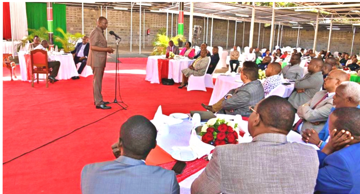
President William Ruto addresses Meru County leaders at a meeting held at State Lodge in Nakuru recently Continued on page 2