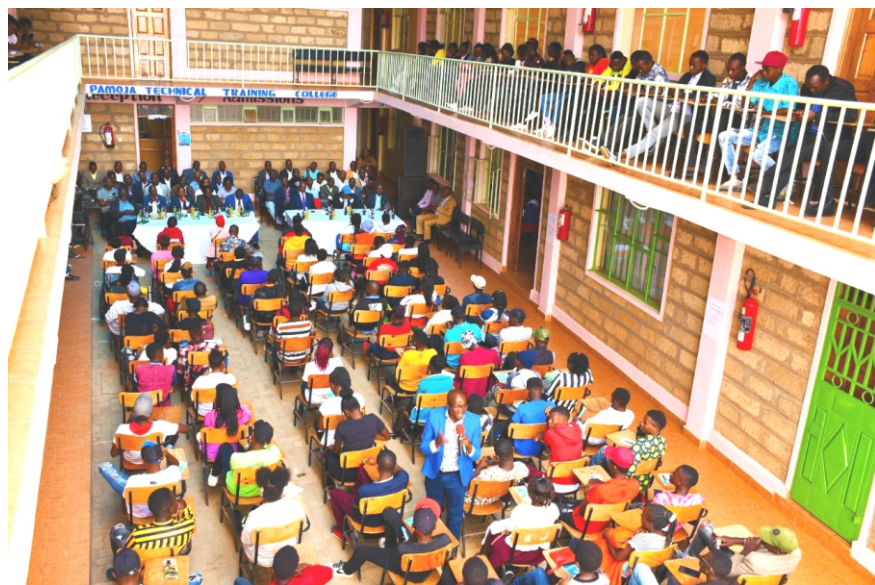
Learners receive career training during an event organised by Yetu Sacco Limited in partnership with Pamoja Technical College

The college has the following academic department; building, electrical engineering, business, automotive and mechanical engineering department. Among many of the benefits that the new college is expected to offer to learners is reaching out to industries and partnering with them to enable students from the institution to secure internships and jobs.