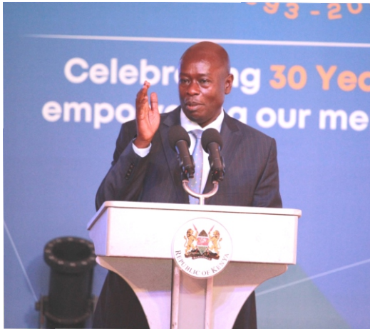
Deputy President Rigathi Gachagua

On behalf of the Board of Management, shareholders, staff and the entire Solution Sacco fraternity we would like to sincerely thank those who participated and attended and supported our colourful 30 th Anniversary celebration at Kinoru Stadium.