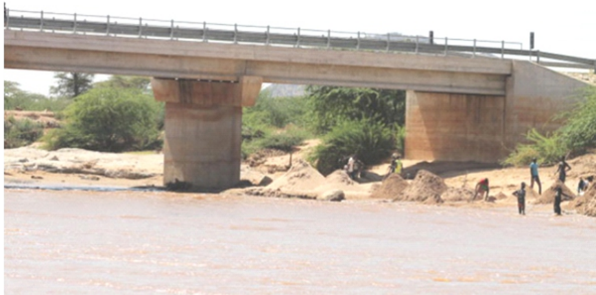
Ewaso Nyiro river: Water level has significantly gone down posing a major threat to Isiolo residents