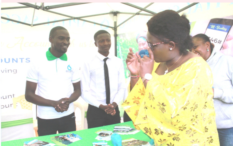
Governor Kawira Mwangaza inspects Capital Sacco's products during Ushirika Day event held at Kaaga Primary School grounds