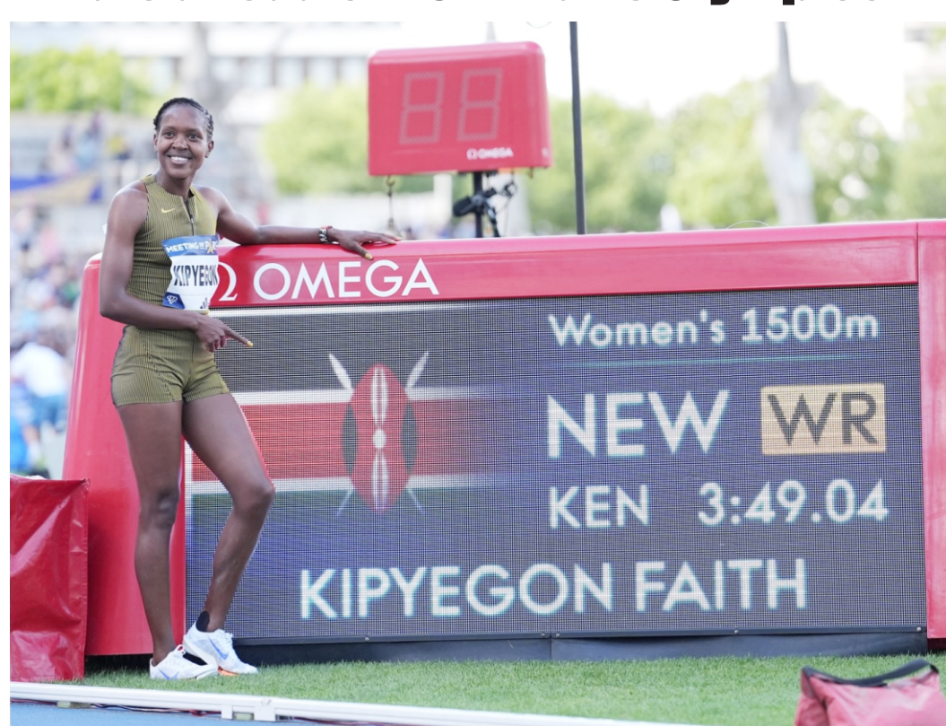
Double world record holder Faith Kipyegon poses for a photo after setting a new world record in the women 1500M race at the Paris Diamond League recently