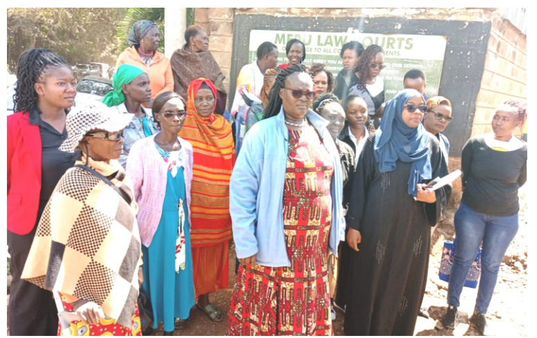
Human rights activists stand outside the Meru Law Court

As the court awaits the DNA results from the Government Chemist, the question remains: Was Naweet acting in self-defence or committing murder? The verdict, set for July 25, 2024, will determine the fate of both the accused and victim