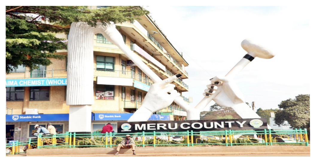
Njuri Ncheke monument located along Njuri Ncheke street in Meru Town

According to local lore passed down through generations, Meru Town owes its name to a