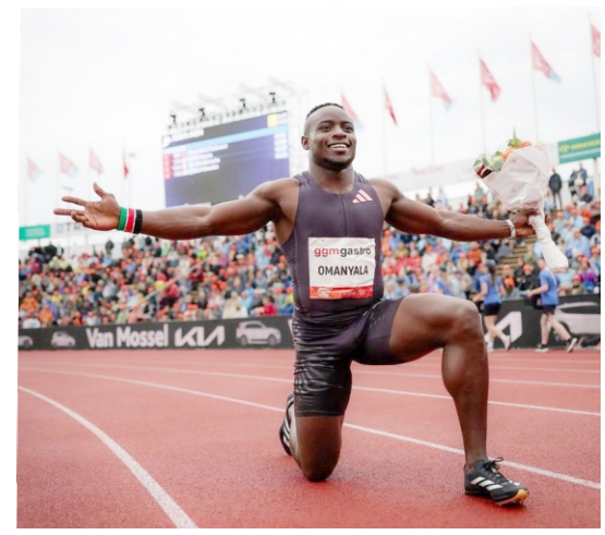
Commonwealth Games 100m champion Ferdinand Omanyala celebrate after winning the 100M race in Hengelo, the Netherlands

Omanyala is rubbing his hands with glee at the prospect of a historic performance in the Paris Games, with this being the first race for the