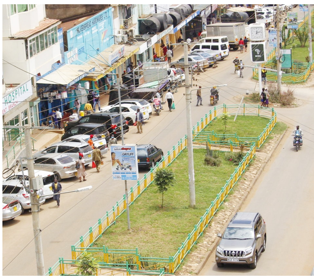
A section of Njuri Ncheke Street in Meru Town

"The Meru community affectionately called him 'Kangangi,' meaning 'the little wanderer,'