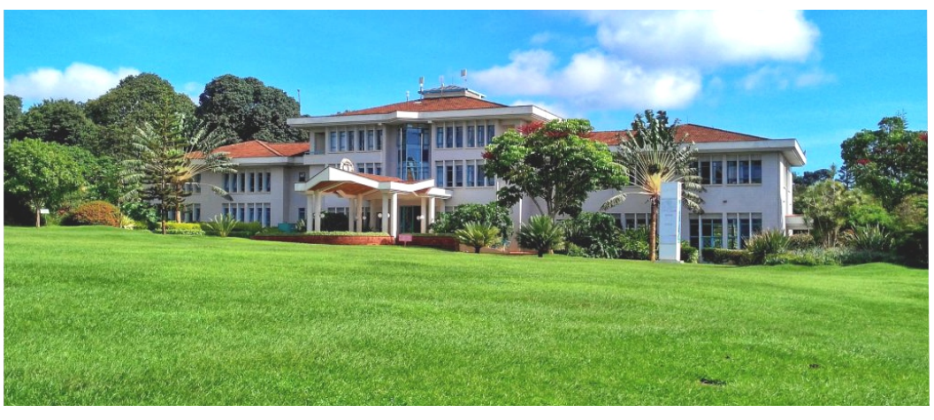
A photo of the serene environment at Kenya Methodist University Main Campus

After earning his PhD, he was promoted to lecturer in 2006. His roles included chair of departments, pioneer of distance learning at KeMU, registrar of academic affairs, and later