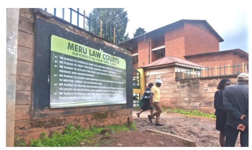
Meru Law Courts: The court is set to determine the fate of a man accused of stabbing Isiolo-based human rights activist