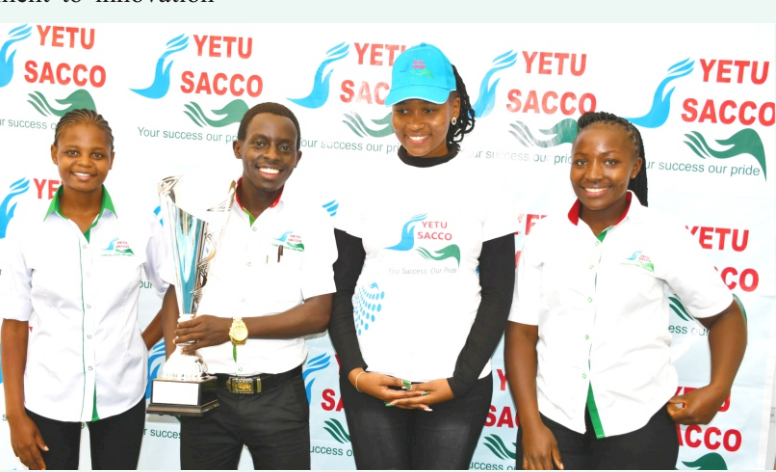
Yetu Sacco team display a trophy won at the ASK Show