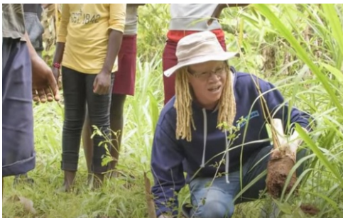
Kamanu engages in a tree-planting activity

lecturer and venture into music full-time.