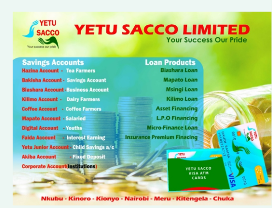
The above poster tabulates the tailor-made savings account and loan products offered by the award winning Yetu DT Saaco

programs to offering training on entrepreneurship and leadership development, the cooperative is committed to empowering its members and creating a brighter future for all.