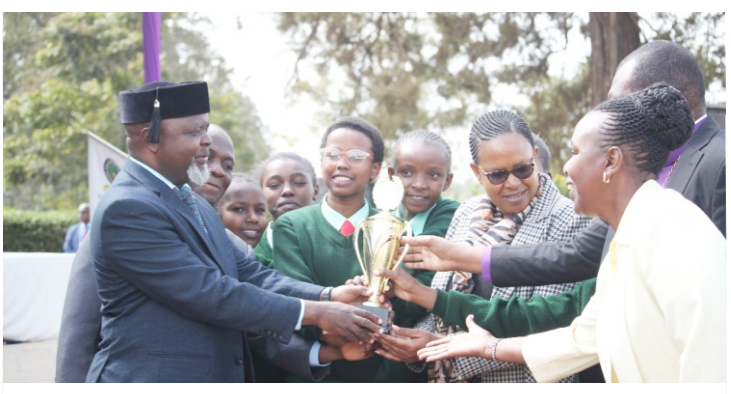
Senator Kathuri Murungi presents an award to Kaaga Girls Highschool students and teachers

Rev. Deye emphasized the Methodist schools' role in nurturing holistic education, aligning with Kenya's Competency-Based Curriculum in nurturing well-rounded individuals.