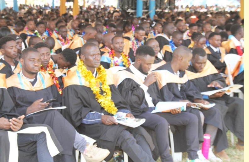
Graduands celebrates the 5th Meru National Polytechnic Graduation Ceremony

The Polytechnic has made significant strides in adopting innovative education methods, including Recognition of Prior Learning (RPL), which acknowledges the diverse backgrounds of learners and enables them to acquire formal qualifications that match their knowledge and skills.