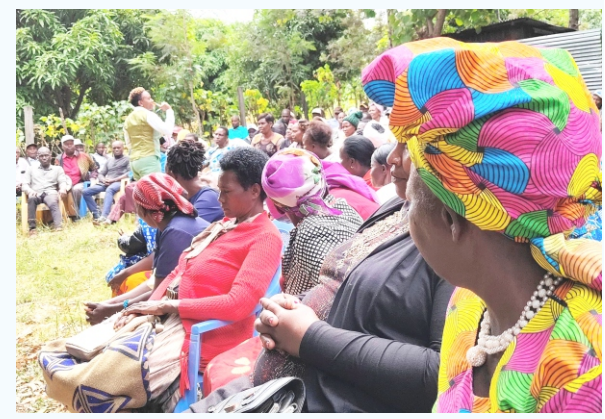
Capital Sacco members during a past education day

With its commitment to financial empowerment, innovative solutions, and inclusive services, Capital Sacco Limited continues to lead the way in providing a holistic approach to financial stability and growth for its members.