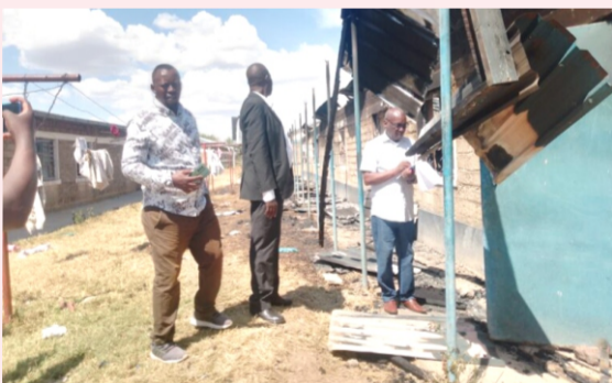
A section of the Isiolo MCAs when they visited Isiolo Girls High School on September 9, 2024