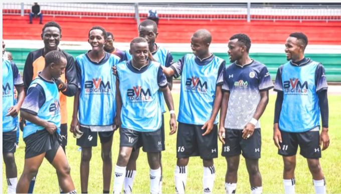
Nembure Sportiff FC players during a recent match day

Since its inception, Nembure Sportiff has been