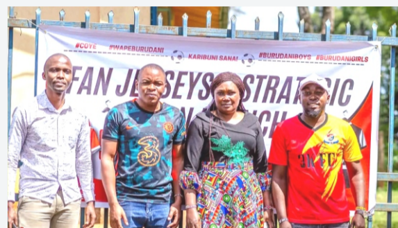
Fans during the launch of Nembure fc Fans kit and Strategic plan at Nembure Social Hall

He also envisions a clubhouse to accommodate players and the coaching staff, fostering a