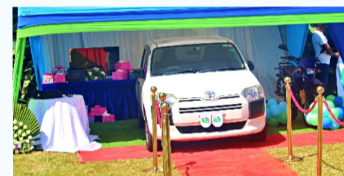
A display of some of the prizes in the Pepea Na Capital Sacco draw, including a brand new Toyota Probox. Participants stand a chance to win these exciting rewards