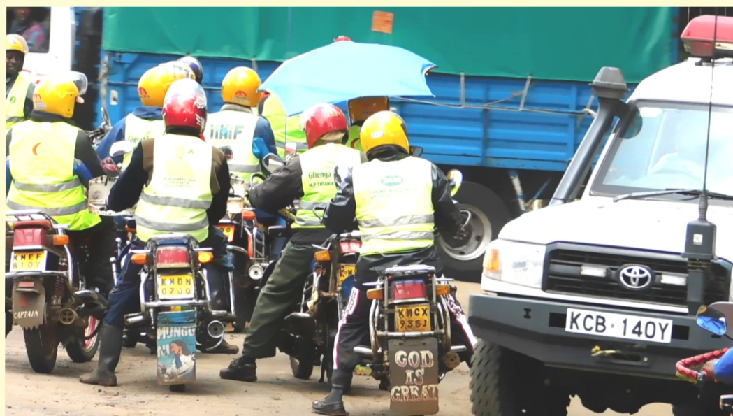
Boda boda riders ready to ferry customers to various destinations. The operators from the Igembe South, Igembe Central, and Igembe North regions have appealed to security agencies to beef up security in the area.