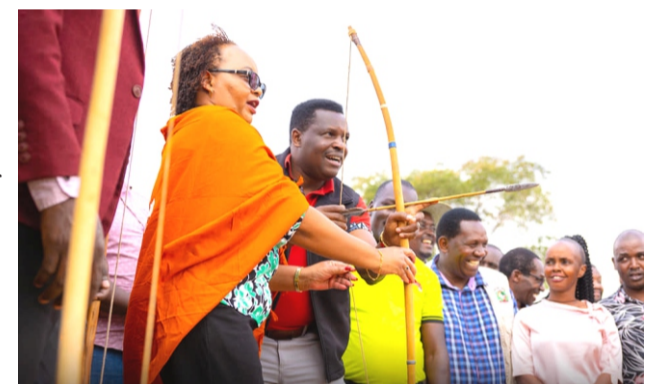
GVN Njuki demonstrate the bowl and arrow game at the Ura Gate Festivals. On looking is Governor Waiguru