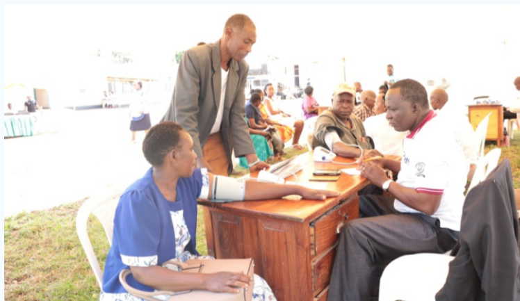
Doctors attend to patients at Kanyakine Sub County Hospital in South Imenti, Meru during a cancer screening exercise

"We urge our community to prioritize education on healthy diets and cancer screening as