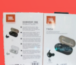
JBL Sport Wireless Earbuds