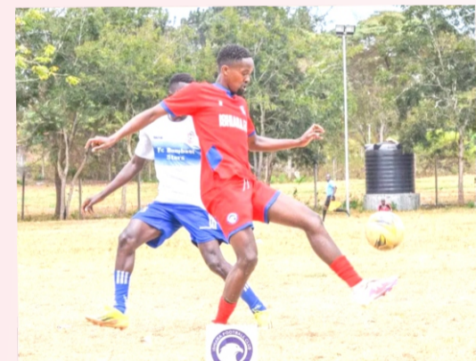
Westo of Ishiara tackling a ball with Bumbani stars player

The grand finale was a true spectacle, with FC Dynamo exhibiting a masterclass in football as they dispatched Bumbani Stars with a commanding 4-1 victory.