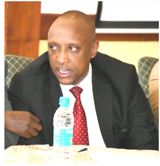
Governor Abdi Ibrahim Hassan