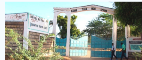
Photo: Galbatula High School gate. The school's alumni are determined to restore the glory of the once famous academic giant institution

Currently, the school has seen improvements in student population, academic performance, and facilities, including the acquisition of a school bus and the installation of DST.