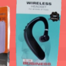
Headset 109 Business Design