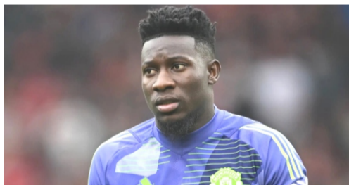
Manchester United and Cameroon goalkeeper Andre Onana in Uganda during their match against Zimbabwe