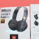
Wireless Bluetooth Headphones