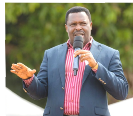
Governor Muthomi Njuki

The County Executive failed to provide quarterly analyses and consumption patterns for fuel procured through framework agreements, making the reported figures highly suspicious.