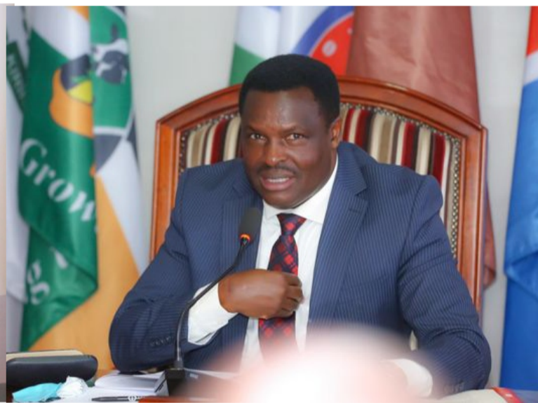
Governor Muthomi Njuki