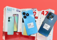
Itel A60, A04 and A70