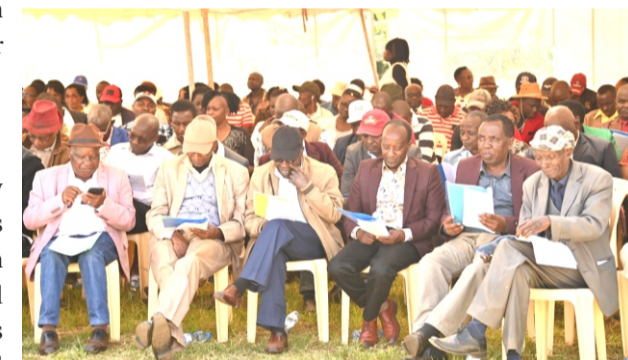
The sacco members follow proceedings during a past AGM

The cooperative has also greatly enhanced its loan portfolio, which has burgeoned to over Sh7.65 billion. This influx of loans enables members to pursue essential personal and business ventures, thereby spurring economic activity within their communities.