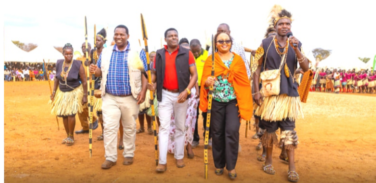
Kirinyaga Governor Waiguru (right), Muthomi Njuki of Tharaka Nithi (centre) and D G Nyagah Mwisiracli at the Ura Gate Cultural Festival in Tharaka constituency

In a heartfelt conclusion, Njuki reflected on Tharaka Nithi County's vibrant cultural heritage, stating, "We proudly opened the 2024 Ura Gate Cultural Festival, a true crown jewel of our community that celebrates our natural wonders and unity."