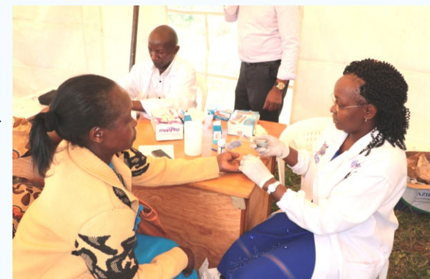
Locals turn up for a cancer screening exercise at Kanyakine Sub County Hospital

Community members are encouraged to participate in health education initiatives and regular screenings to tackle this formidable enemy head-on. With unity and determination, it is hoped that the tide can be turned against cancer in Meru County.