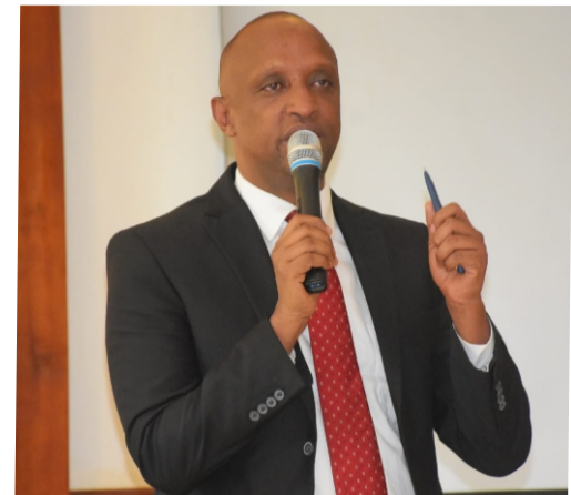
Isiolo Governor Ibrahim Hassan

Under the employment laws, deviations were noted, as payroll records indicated that 19 employees surpassed the mandatory retirement age. The county also faced scrutiny for payments made for the Governor's rental allowance, while failing to construct an official residence.