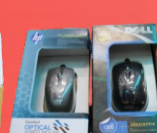
Optical Wired Mouse