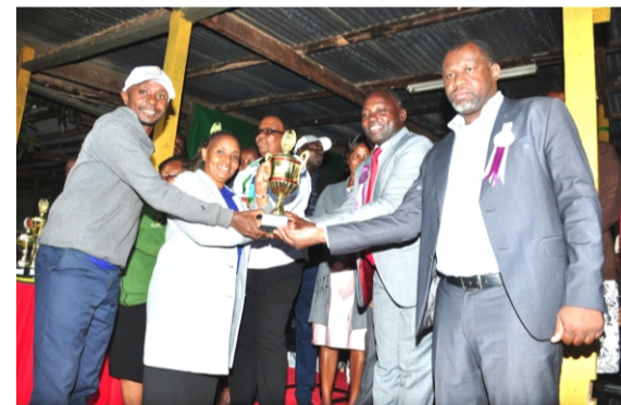
Solution Sacco officers receive a trophy during the Meru National Agricultural Show