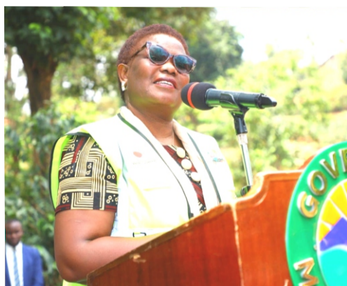
Governor Kawira Mwangaza