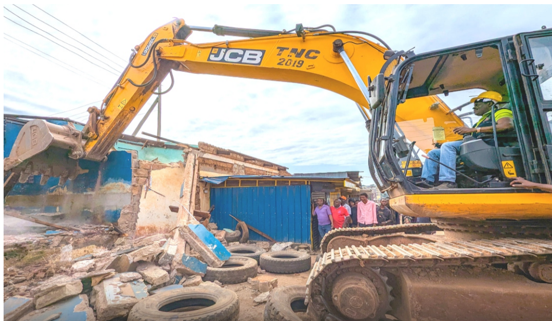
Governor Njuki launches demolition of Marigiti Market to pave way for construction of a new modern Market

Njuki assured the public that the primary objective of this initiative is to foster a conducive environment for all businesspersons in the area.