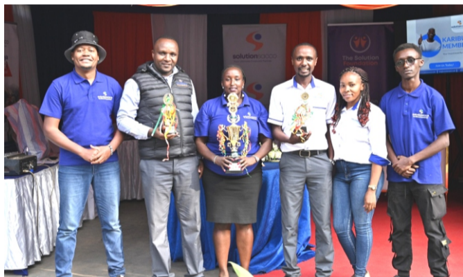
Solution Sacco members of staff display trophies won during the Meru National Agricultural Show early this year

To further incentivize members to save and invest in their future, Solution Sacco introduced various savings products. This innovative savings product offers attractive interest rates encouraging members to cultivate a habit of saving and investing for long-term prosperity. Every member can start with Solution Sacco, making it accessible to everyone, regardless of their economic background.