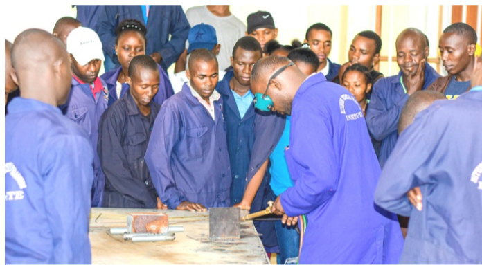
Mitunguu Technical Training Institute students in a civil engineering class