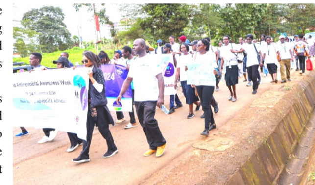
Medics take a road walk during the antimicrobial awareness campaign