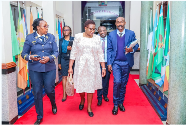
Governor Kawira Mwangaza (centre) is accompanied by her lawyers during her impeachment hearing at the Senate

Moreover, elected officials entangled in