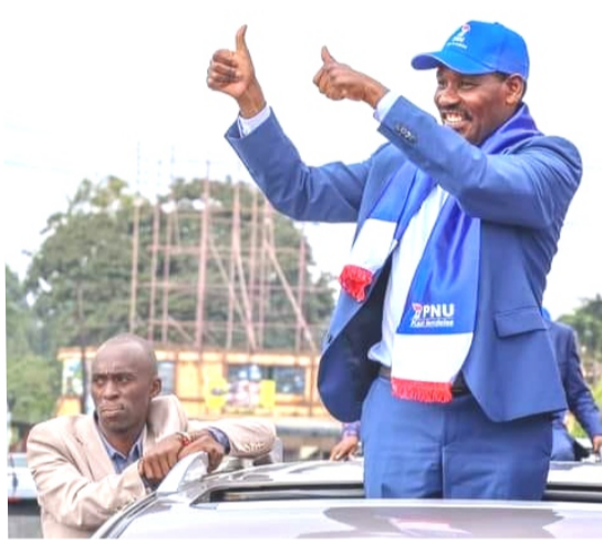
PNU leader and former CS Peter Munya