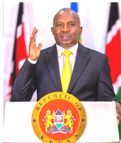
Power Players: Deputy President Kithure Kindiki (left) and Governor Muthomi Njuki-Two influential figures shaping the landscape of the 2027 Gubernatorial elections.

"Everyone should fight for themselves. I only have one vote. Talking to any of the contestants does not mean I favor them over the others," he emphasized during a recent press conference.