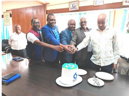
Capital Sacco Board members cut a cake during this year's customer service week

Forget about ordinary festivities; this year could be your chance to make lasting memories filled with excitement and joy!