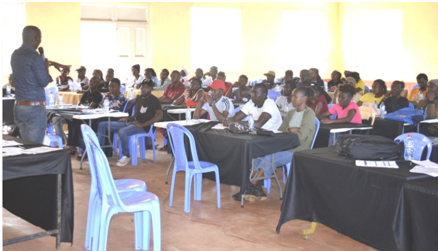
Youth participate in a business skills training session organized by Community Road Empowerment (CORE)