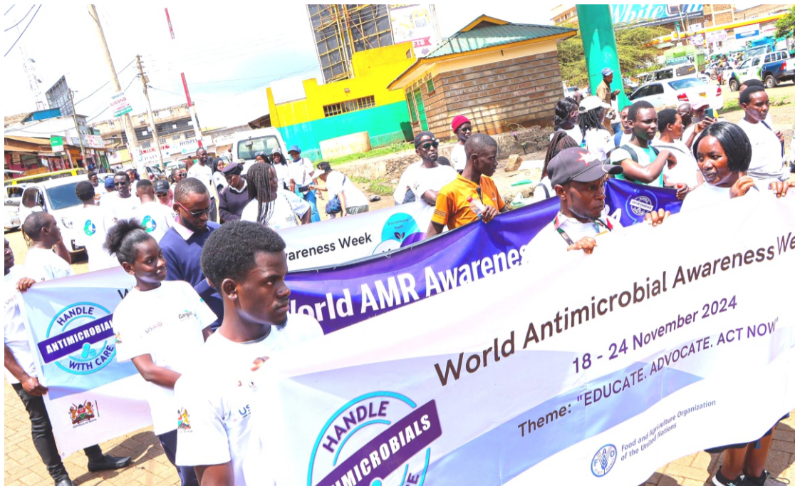
National and County Government medical staff during the antimicrobial resistance awareness in Meru town streets.