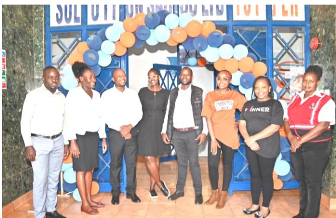
Some of Solution Sacco staff members pose for a photo during the customer service week

those looking for innovative, community-first solutions to financial hurdles, this is a fantastic option.