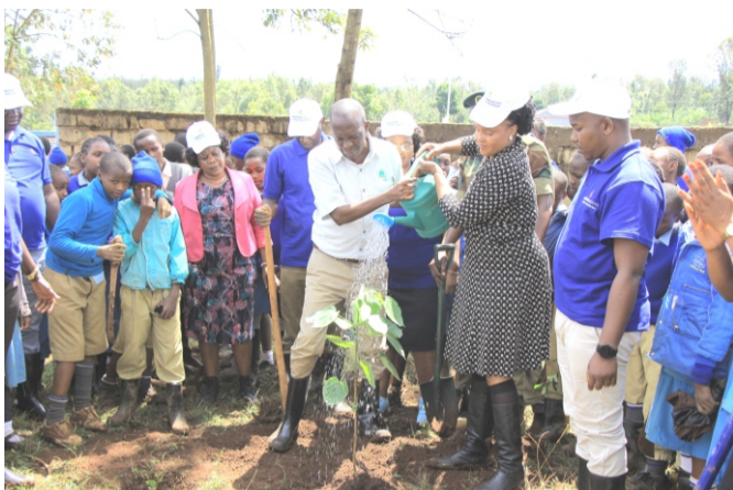
Solution Sacco officials in partnership with Kenya Forest carry out a tree - planting CSR activity

Furthermore, through the establishment of adaptable and personable financial products, Solution Sacco enables its members to tailor their financial plans to meet their specific goals.