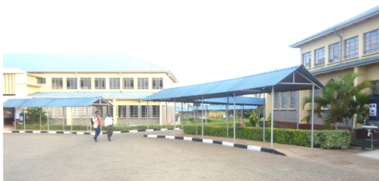
A serene environment at Mitunguu Technical Training Institute. The institute has been elevated to the status of a National Polytechnic

With this latest upgrade, the number of polytechnics in Kenya now stands at 28, following the elevation of 13 other institutions last year.