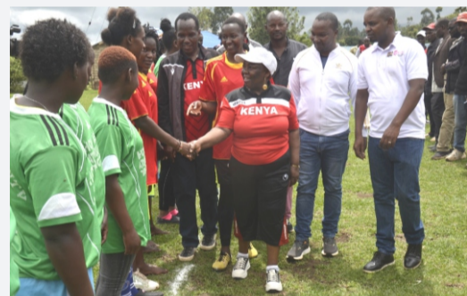
Kailemia greeting players during the tournament

competition; it's a call to action," she declared. "We've lost too many women to violence; it's time to take a decisive stand."