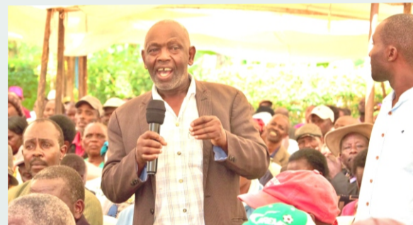
A Yetu Sacco member raises a query during the Special General Meeting