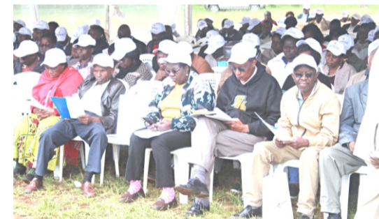
Members of the Sacco follow up the proceedings of a past AGM meeting

The Imarika Loan is designed to meet your immediate financial needs while allowing you to maintain peace of mind regarding repayment. For