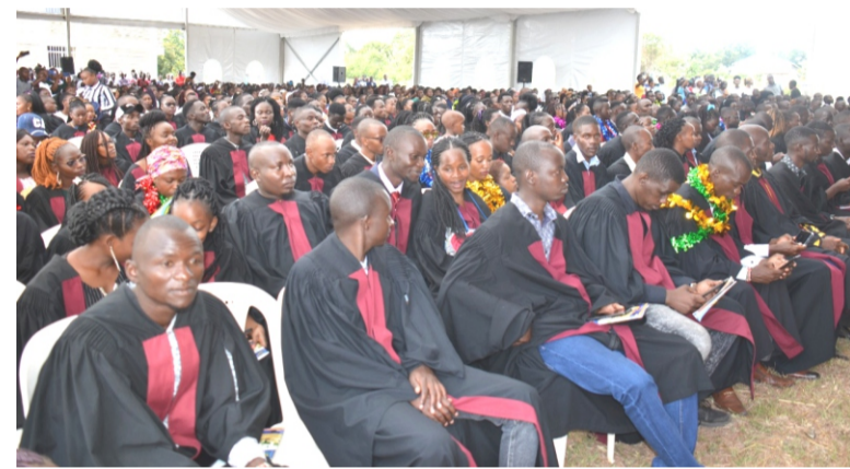
Graduates follow up the proceeding of the 1st graduation ceremony in January 2023

The emphasis on upgrading technical education and reforming the university system represents a critical advancement in Kenya's educational framework, aligning with modern