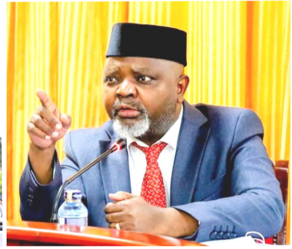
Meru Senator and Deputy Speaker of the Senate Kathuri Murungi