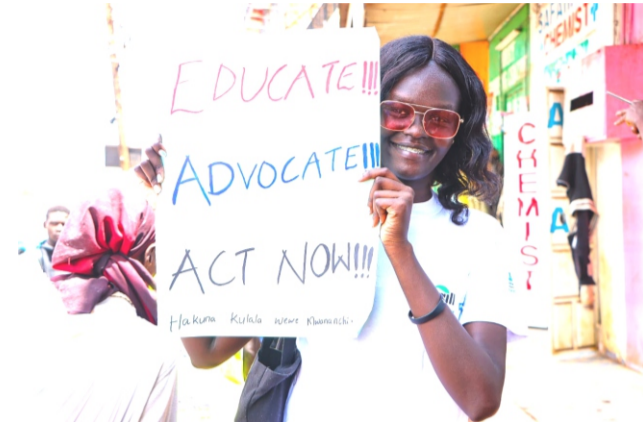
A Meru County medical staff displays a placard containing antimicrobial awareness campaign messages

extrinsic factors when microbes outsmart the medications meant to treat them.