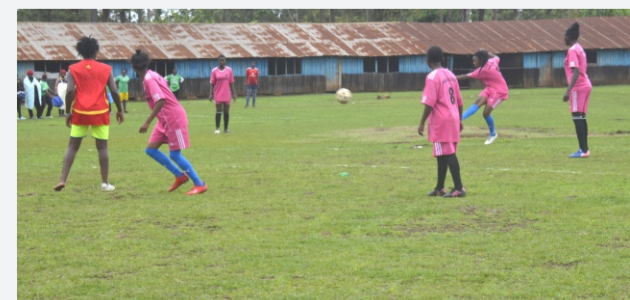
A player strikes the ball during the tournament

The ultimate victors of the Nyambene Edition will receive cash prizes, thereby incentivizing participation while delivering a strong message: "Enough is Enough – End GBV in Meru County."