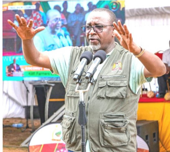
Former Agriculture CS Mithika Linturi