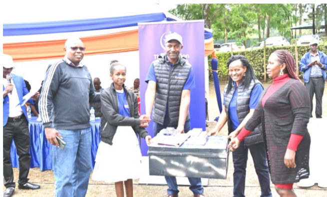
Some Solution Sacco staff and board member present school items to a beneficiary as a way of promoting members of the society

As a member of Solution Sacco, you open the door to a myriad of investment opportunities. With innovative financial instruments at your disposal—such as shares, fixed deposits, and more—your potential for financial growth knows no bounds.