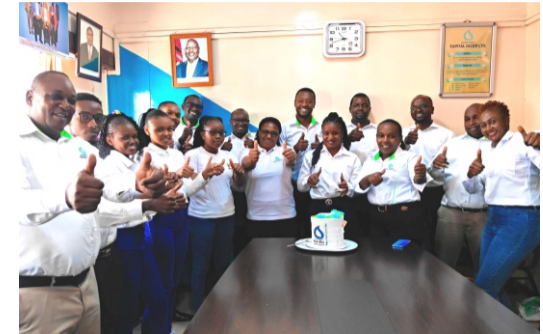
Capital Sacco staff members pose for a photo as they commemorated the customer service week

Take part in the Pepea Na Capital Sacco Shares Promotion, and who knows? That dream car, fridge, or gift card could be yours this festive season!