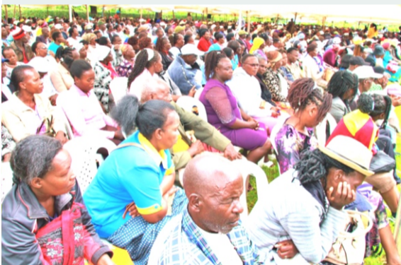
Yetu Sacco Members during the meeting