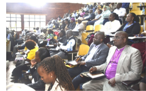
A group of participants attending the workshop