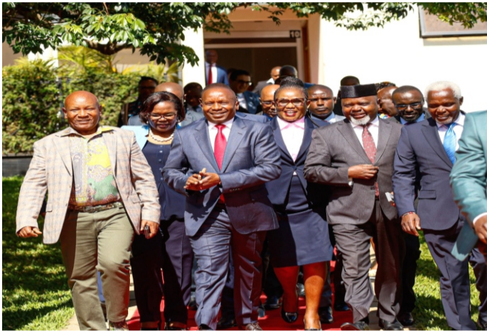
Deputy President Kithure Kindiki with Meru leaders at his Karen home.

As political rhetoric intensifies, the fate of the Kenya Kwanza administration in Mt. Kenya East hangs delicately in the balance, awaiting resolution in the unfolding saga of Kithure Kindiki versus Rigathi Gachagua.