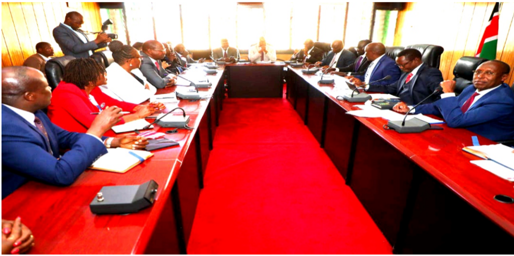
Meru leaders and officials from the ministry of Agriculture & Livestock in a consultative meeting on Miraa

Following the consultative meeting, three days later, the Ministry of Agriculture and Livestock Development, through the Cabinet Secretary Mutahi Kagwe, released the revised miraa prices, which were expected to take effect immediately for the benefit of the farmers and the traders.