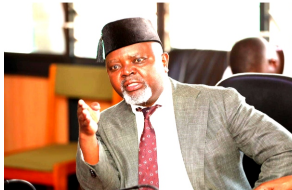
Senator Kathuri Murungi

Adding fuel to the political fire, the influential