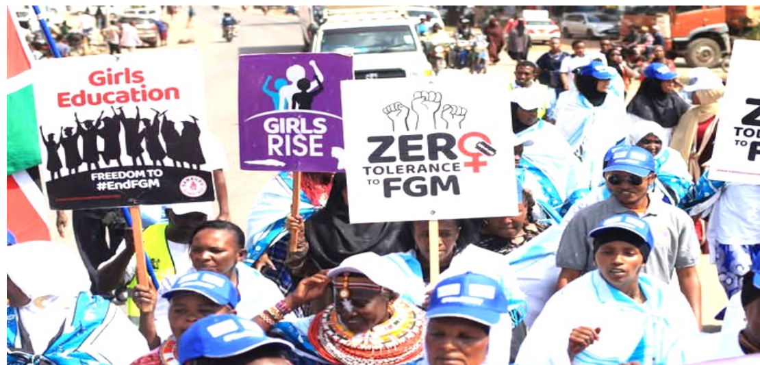
Women's rights advocates march peacefully in Isiolo in a past event

"The lack of a rescue center discourages girls from reporting cases. Many prefer to stay in danger rather than risk the consequences of speaking out," Akope explained.