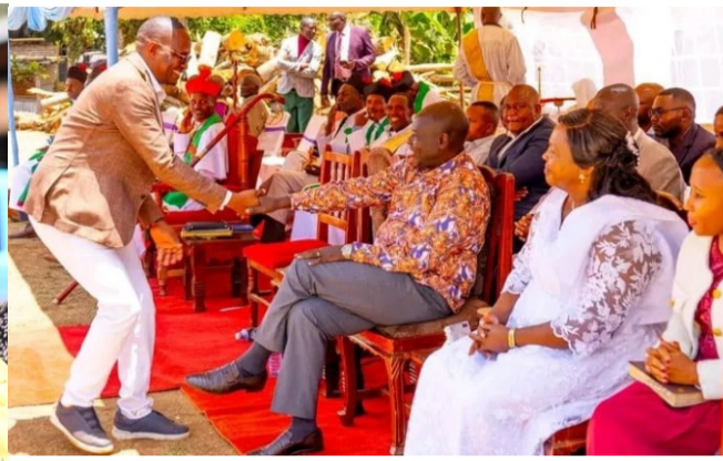
Former Deputy President Rigathi Gachagua attending a church service in Igembe North recently

within the region favoring Gachagua. The former Deputy President has even claimed familial ties to Meru County, further deepening his ties within the region. This bid to reclaim allegiances has left Ruto's allies on edge, as tensions mount in a region that has historically been a stronghold for Kenya Kwanza.