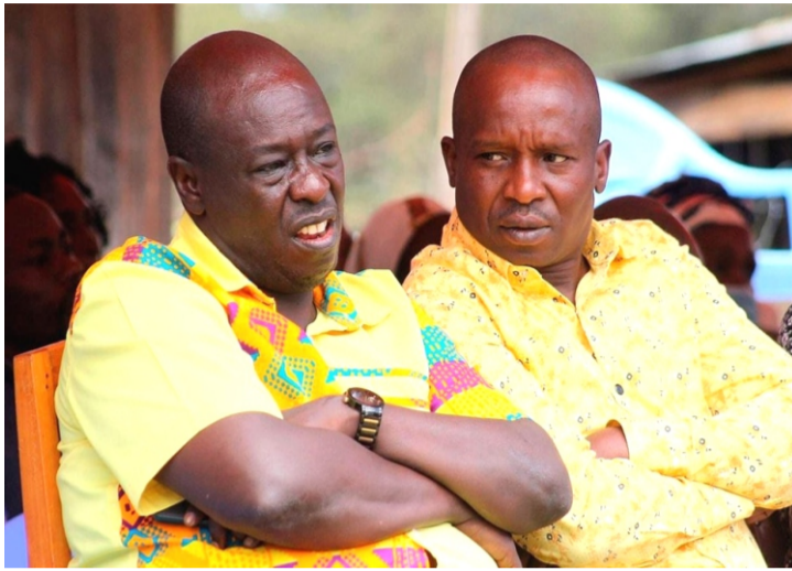
Former Deputy President Rigathi Gachagua & Deputy President Kithure Kindiki

Following Gachagua's unexpected ouster from the Deputy President position in October, the former DP has been working diligently to re-establish his influence, hosting numerous meetings at his Wamunyoru residence that have drawn in political heavyweights and community leaders eager to rally behind him. Kindiki's base of support appears to be at risk, with critics suggesting a growing alignment