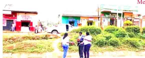
Dr Muguna leads an operation to determine bars situated near schools