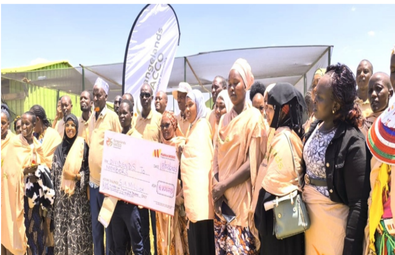
Rangelands Sacco officials, members and delegates during their annual meeting