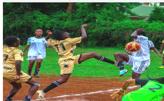
Blackpanther queens Fc in a past match.

She further thanked everyone who continues to support team's journey and she believes in a brighter future for her team and women's Football and welcomed anyone willing to partner or sponsor the team while welcoming fans to cheer and celebrate with them during their matches, Blackpanther Queens plays their home matches at Kaaga Methodist ground commonly known as Sansiro.