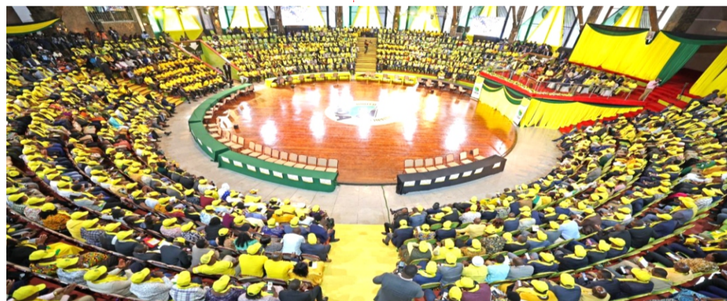
UDA party delegates at the Bomas Of Kenya

However, Mt. Kenya region is once again left out. During last year's grassroots elections, Nyandarua, Tharaka Nithi, Kiambu, Embu, Meru, Murang'a, Nyeri, Kirinyaga, and Laikipia counties were lined up for the second phase of the elections, which never took