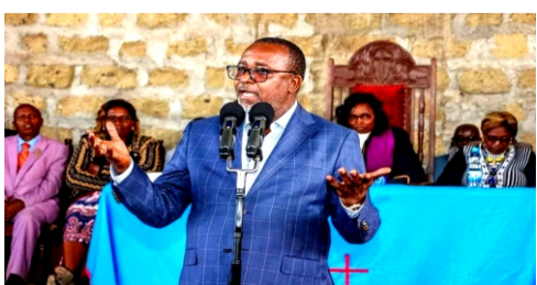
Former CS Mithika Linturi

"I refused to dine with the powerful because I