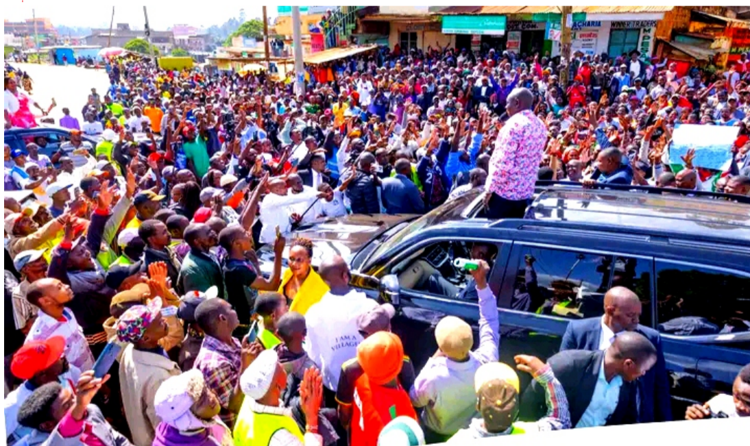
Former Deputy President Rigathi Gachagua in a past political rally after his impeachment