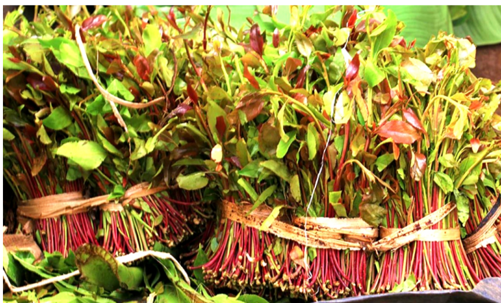
Harvested bundles of Miraa ready for sale

The government has promised to continue addressing the market access challenges to expand on export opportunities in the current and new miraa markets.