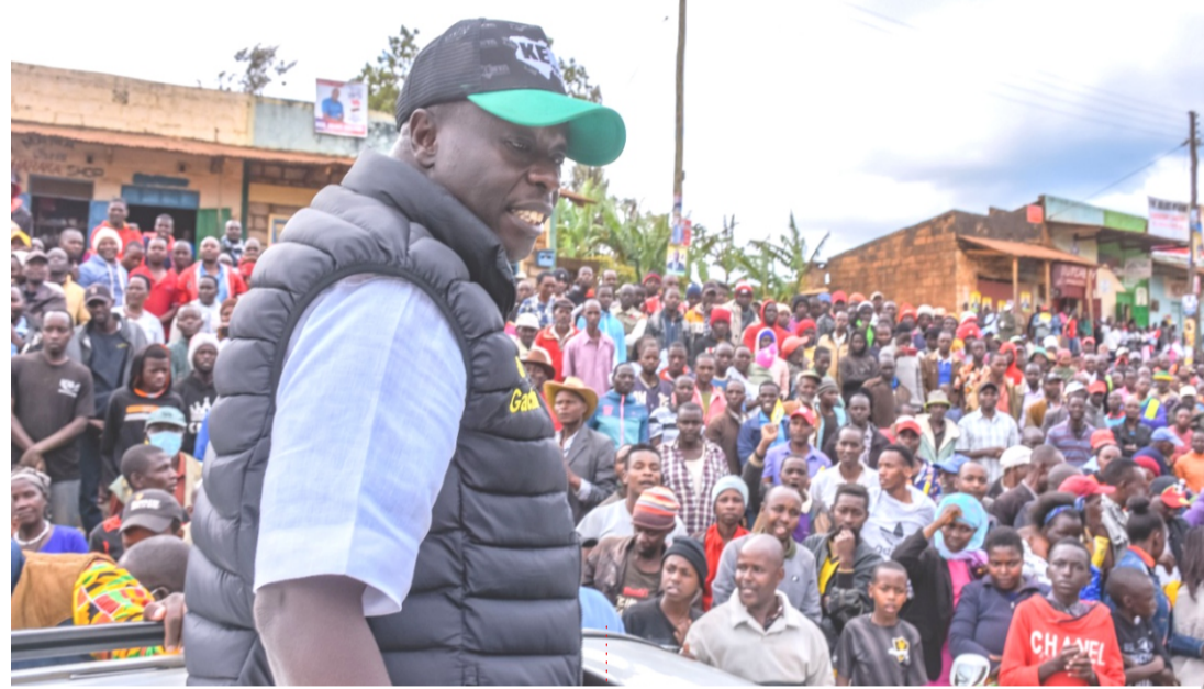
Former Deputy President Rigathi Gachagua in a rally after his impeachment

Despite the tumult, Kindiki has shown resolve to dismantle the Gachagua narrative and steer