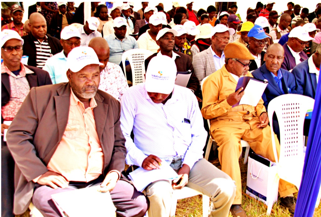
Solution Sacco Members following updates during the 32nd AGM

Following regulations from the Sacco Society Regulatory Authority (SASRA), the organization has witnessed outstanding asset growth since 2011. From Ksh 2.3 billion in assets in 2011, Solution Sacco has seen