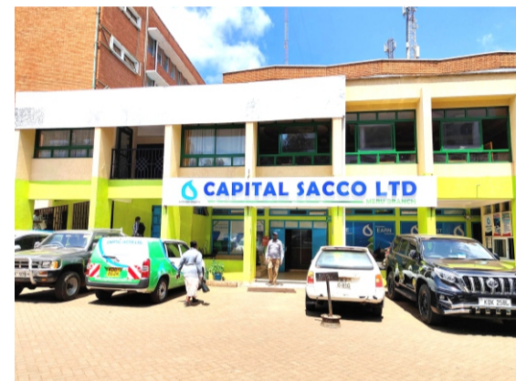
Capital Sacco office-Meru Branch

The journey from humble beginnings to becoming a market leader is a testament to the power of vision, dedication, and an unwavering