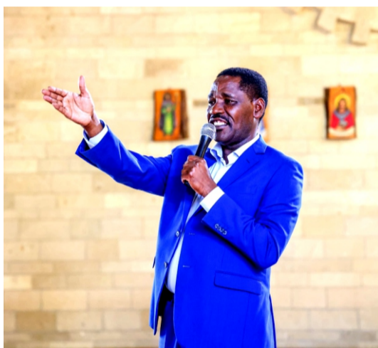
Former CS Peter Munya

stand for the common man," Mwangaza declared, echoing sentiments that resonate deeply with an electorate weary of power