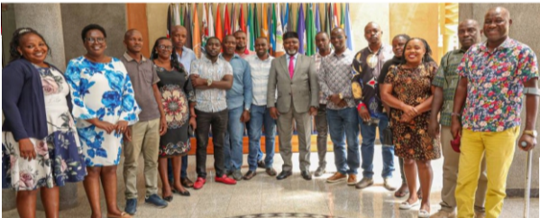
A section of Meru MCA's paid a visit to the office of Senator Kathuri Murungi in Nairobi