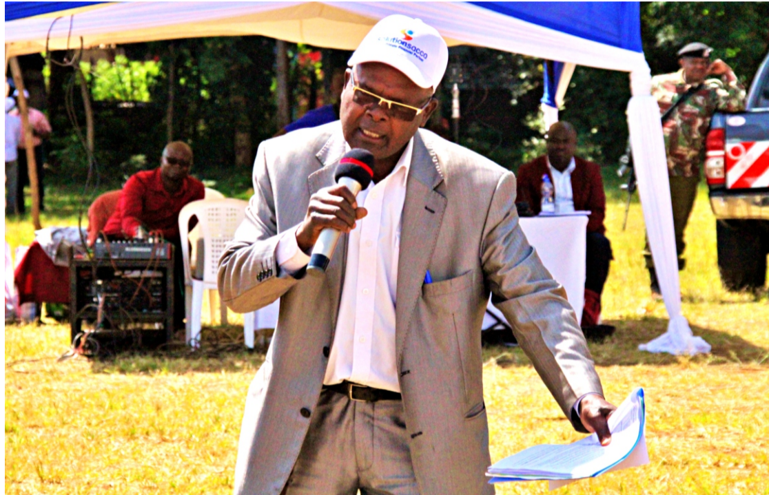
A member asks a question during the Sacco's AGM

Accountability also plays a crucial role in the decision-making processes. Board members are encouraged to make well-informed choices based on comprehensive analyses focusing on the Sacco's well-being. The crucial role of independent audits and performance evaluations in promoting board accountability is underscored as