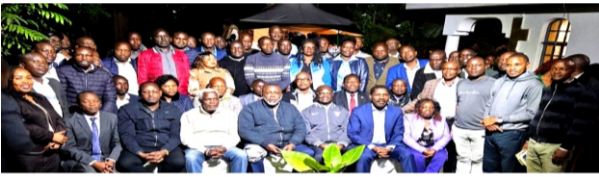
A picture of former Cs's Peter Munya, Mithika Linturi, former Governor Kiraitu Murungi, MPs MCA's and other leaders in a recent meeting