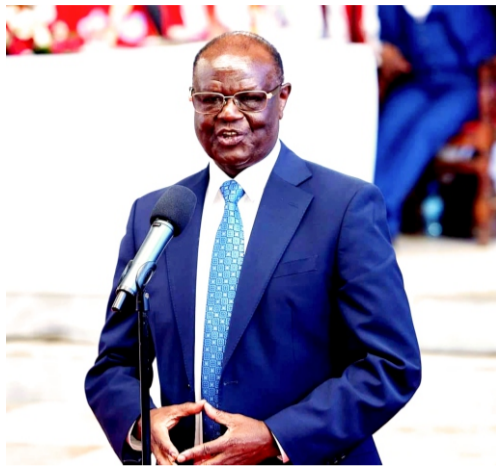
Former Governor Kiraitu Murungi

stand for the common man," Mwangaza declared, echoing sentiments that resonate deeply with an electorate weary of power