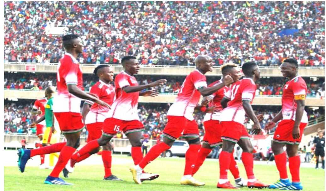
Harambee Stars players celebrate a goal in a past match

"Our goal is to restore Kenya's football glory,