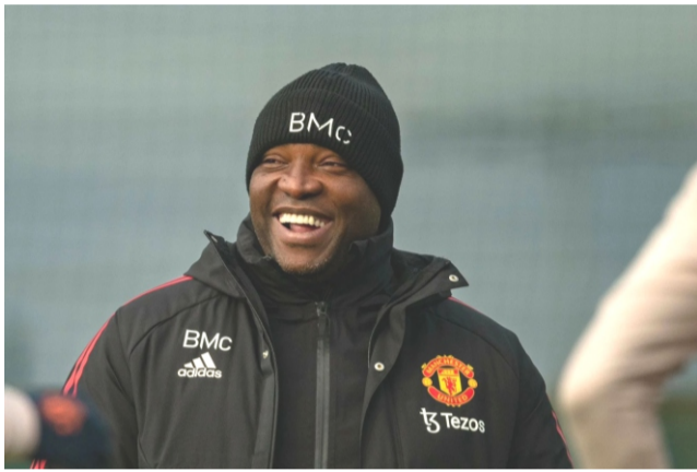
Benni McCarthy, the newly appointed Harambee Stars head coach

As a coach, McCarthy has managed Cape Town City and Amazulu, and he served as an assistant coach at Belgian side Sint-Truiden. From 2020 to 2024, he was part of Manchester