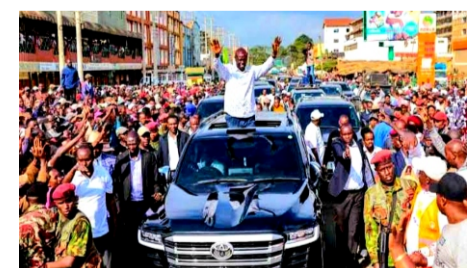
Gachagua's tour in Murang'a after his impeachment

Some officials have since avoided holding political engagements in the region over the perceived hostility. This as Mr. Gachagua continues to fan anti-Ruto sentiments in the