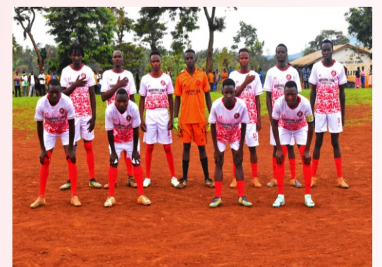
Awakening Lions FC

The two teams are also appealing for any well-wisher or organization to offer a helping hand in ensuring that the talents they are nurturing don't go to waste. As football is the only way to keep the youths engaged hence curbing emerging vices like drug and substance abuse in the community.