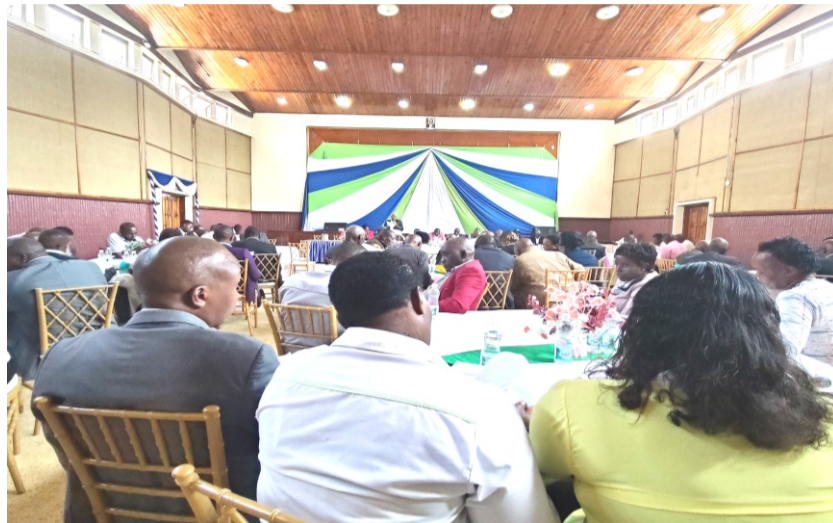
Capital Sacco delegates attentive during the AGM

With a mission to deliver quality, innovative financial solutions, Capital Sacco is well-positioned to lead in the industry. The Sacco