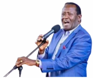
Tigania East MP Mpuru Aburi

Political observers note that the ongoing confrontation may extend well into the 2027 campaigns, with both leaders expected to play central roles in shaping voter sentiment.