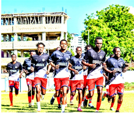
Ishiara FC Players warming up before a match

Their struggles reflect not just technical lapses but structural weaknesses that need urgent intervention.