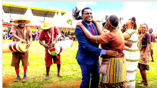
Governor Njuki with Traditional dancers during the Jamuhuri day celebrations

When our communities thrive, our environment thrives, and tourism flourishes,” Njuki concluded, sending a clear message that economic empowerment and environmental stewardship must go hand in hand.