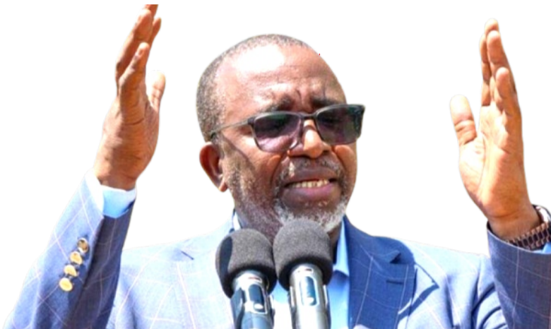
Former Agriculture CS Mithika Linturi