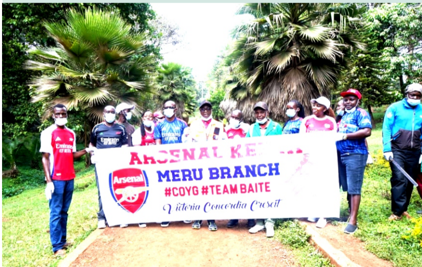
Arsenal Kenya team with the municipal manager during the clean-up exercise at Nteere Park

The project is also expected to support environmental conservation, social cohesion, and tourism growth, while strengthening Meru Municipality's case for city status.