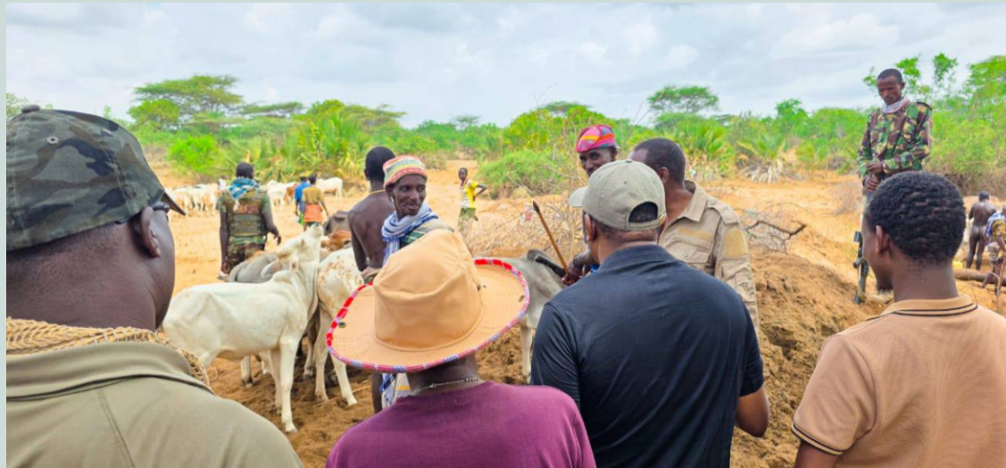
Members of the community during a past public engagement forum

They are pushing for renewed commitment to long-standing resource-sharing