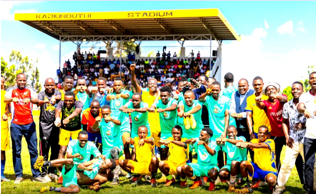
Players delighted after the opening of the completed Kajiunduthi stadium