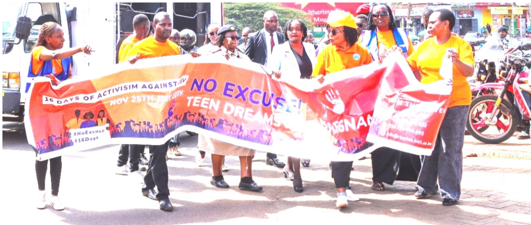
Meru Deputy Governor Hon. Linda Kiome [in a blue blazer] present during the 16 day activism event in Meru Makutano

However, the campaign comes against the backdrop of public outrage following the circulation of a disturbing video allegedly showing a young woman being gang-raped in Laare, Igembe North Sub-County. The incident