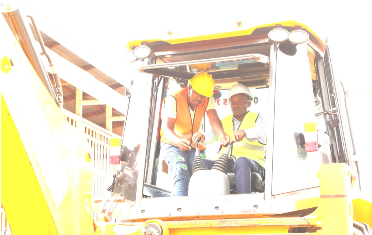
Deputy President Kithure Kindiki during the launch of a Mega construction project at the Meru Teaching and Referral Hospital

They have consistently urged residents to support President Ruto, arguing that loyalty to the government is the surest path to