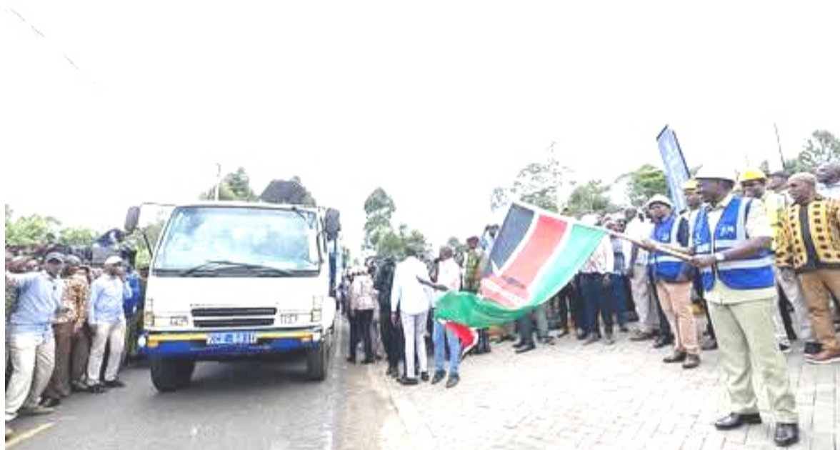
President Ruto leads the launch of a power station in Nkuene Ward, South Imenti