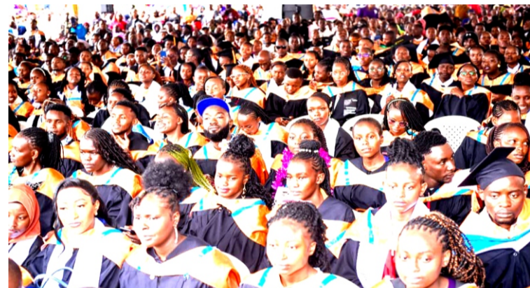
Thousands of Graduands present during the graduation ceremony