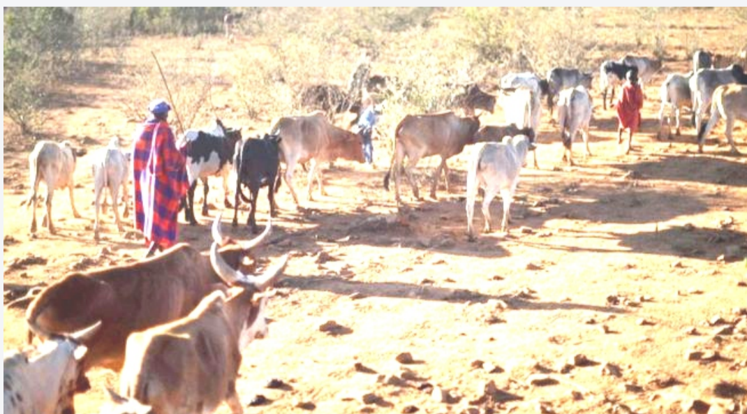
Farmers taking home their cattle amidst the cattle rustling tragedy

Residents hope for an approach that not only arrests perpetrators but also ensures that stolen cattle are returned to rightful owners, restoring both security and livelihoods.