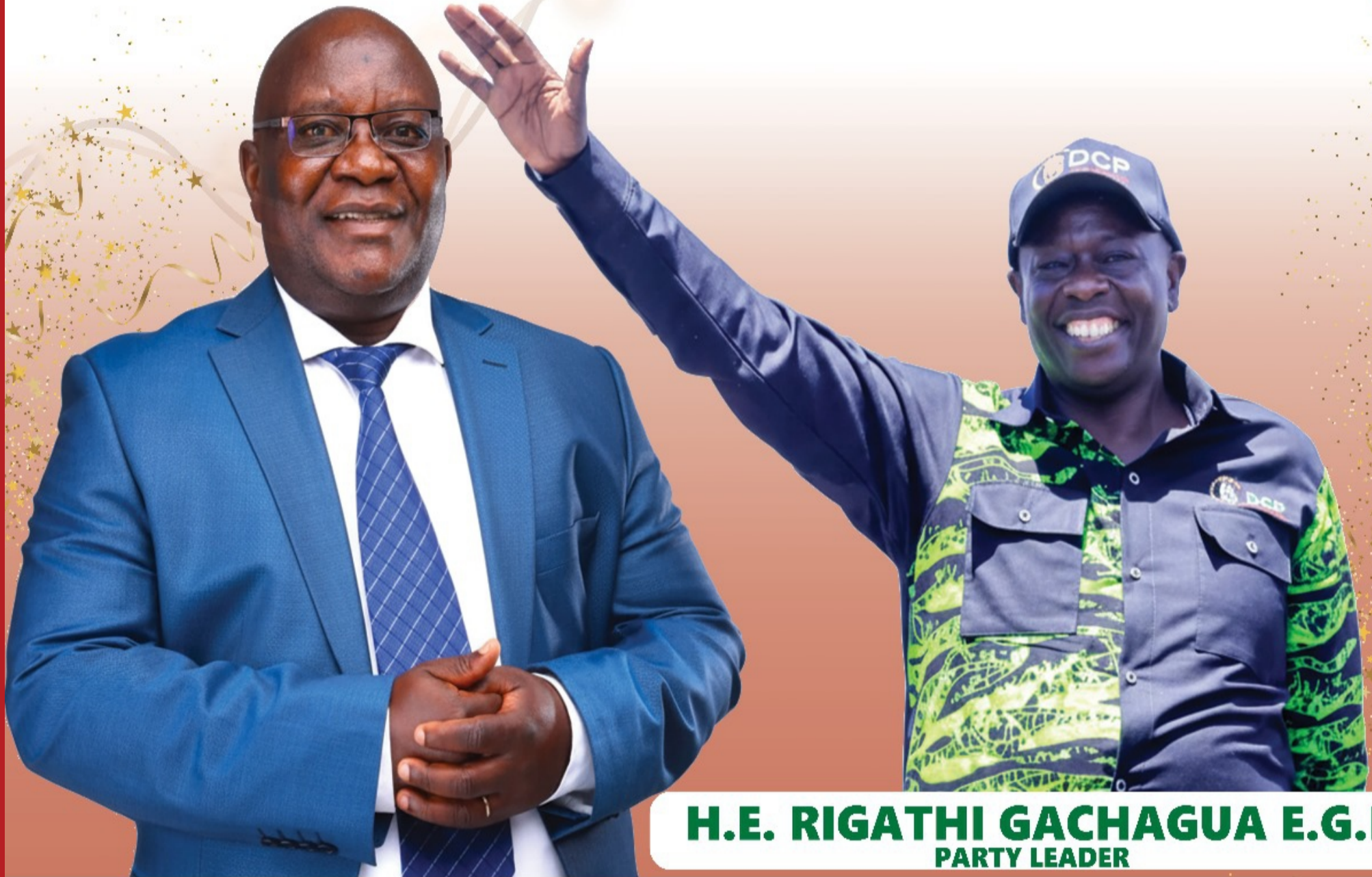
H.E. RIGATHI GACHAGUA E.G.H. PARTY LEADER