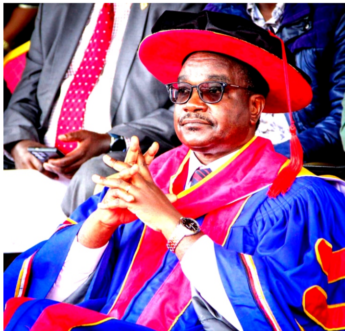
Education CS Hon. Julius Migos Ogamba During the Meru National Polytechnic 6th Graduation ceremony

The CS underscored the critical role of modern Technical and Vocational Education and Training (TVET) institutions in driving the country's economic transformation, job